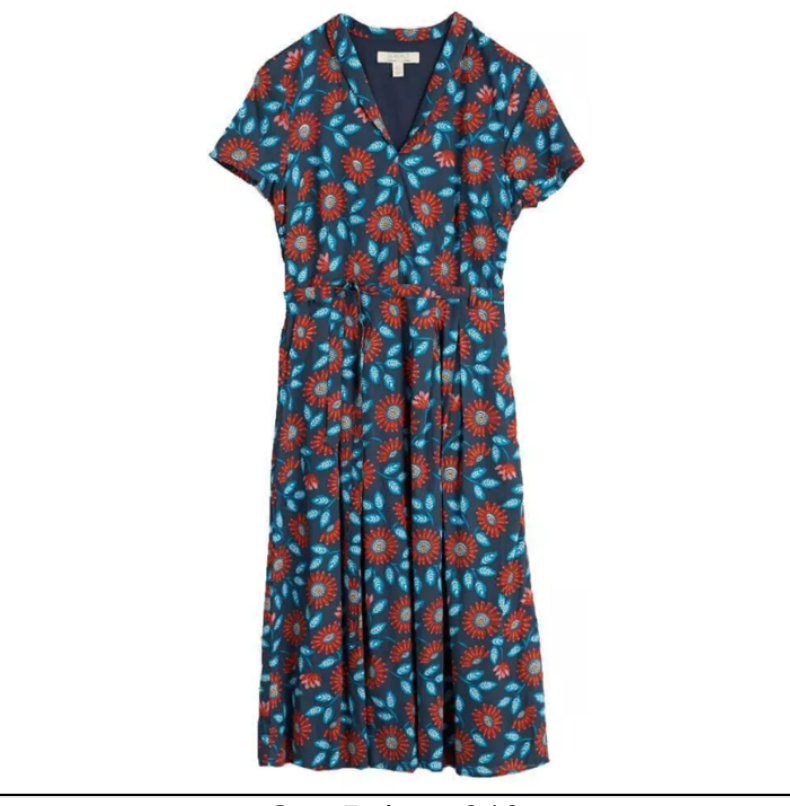
Our Price: £40