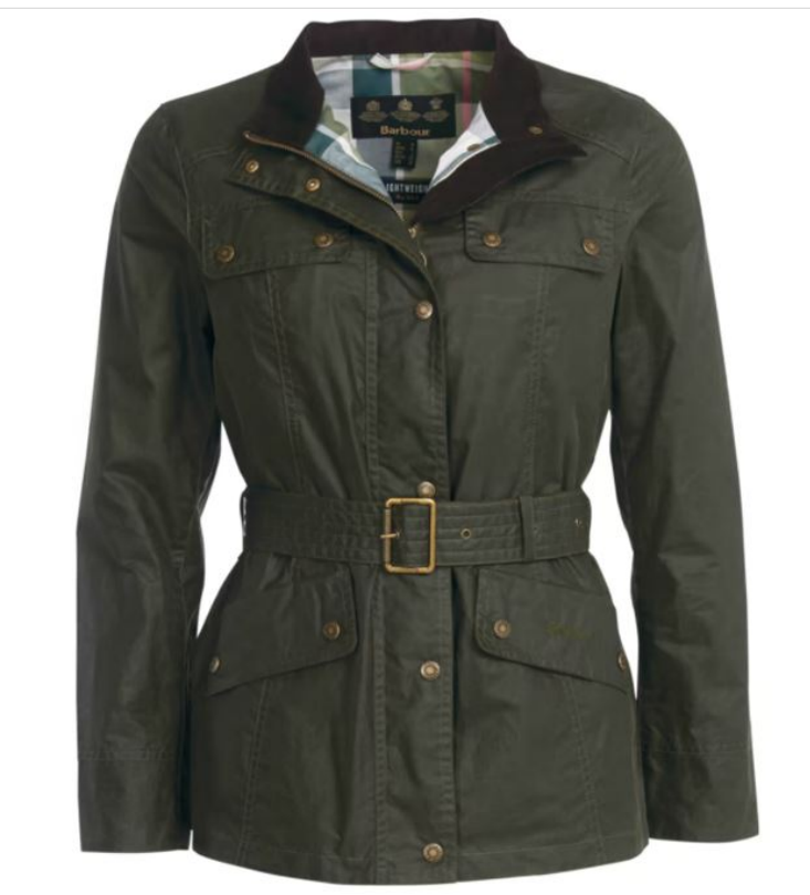
Our Price: £149