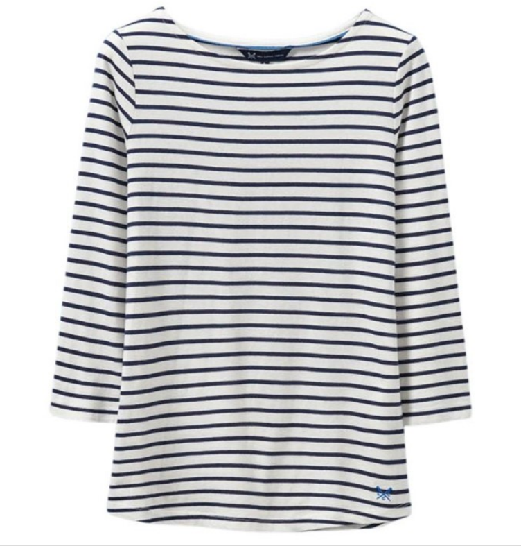
Our Price: £29