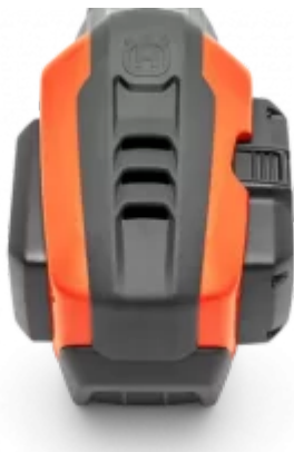
Battery Through Body Design (Pat.Pend.) - Smart battery pack position, placed horizontally through the body of the machine. Reduces the risk of having dirt, chips, dust and water accumulate in the battery compartment. This also means the weight of the battery can be placed in or near the desired centre of gravity and in the rotational axis of the product.