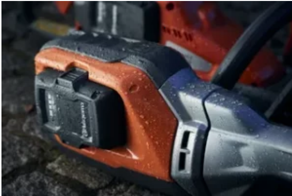
Weatherproof (IPX4) - For use in all weather conditions