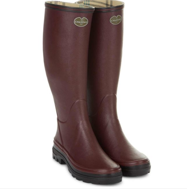
Our Price: £160