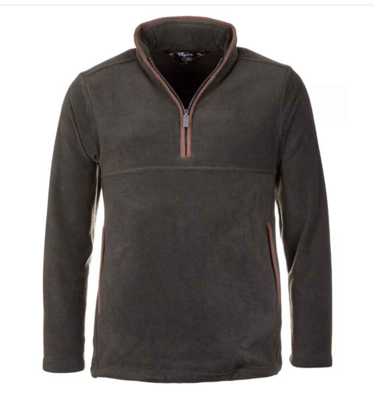
Our Price: £44.99