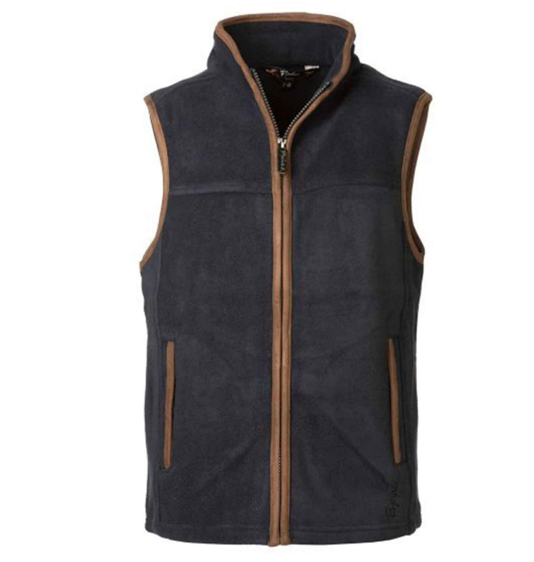
Our Price: £29.99