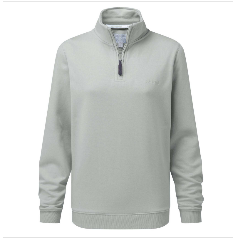
Our Price: £85