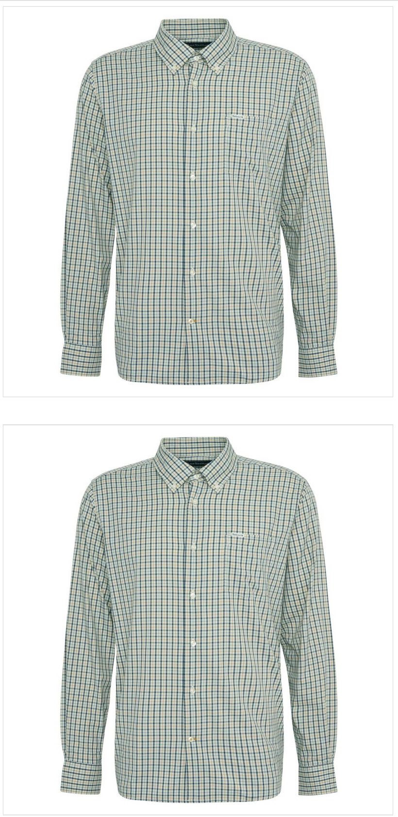
Our Price: £69.95