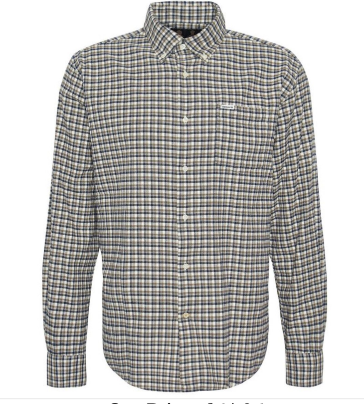
Our Price: £64.96