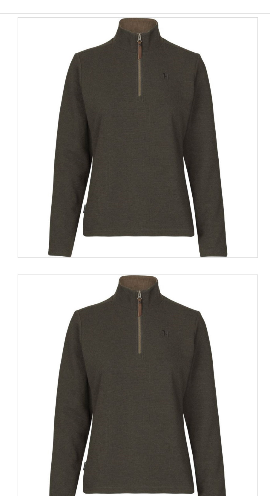
Our Price: £199.99