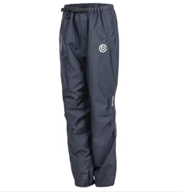
Our Price: £169