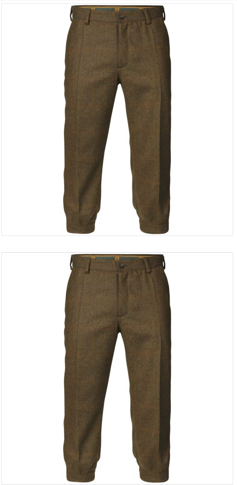
Our Price: £299.99