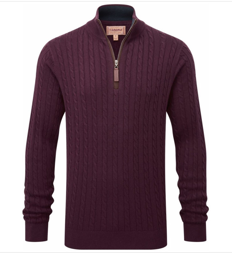
Our Price: £149.95