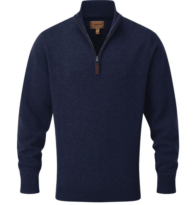
Our Price: £139.96