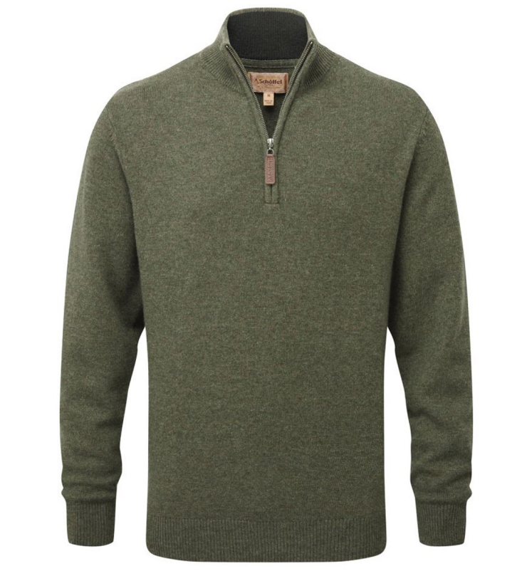
Our Price: £139.96