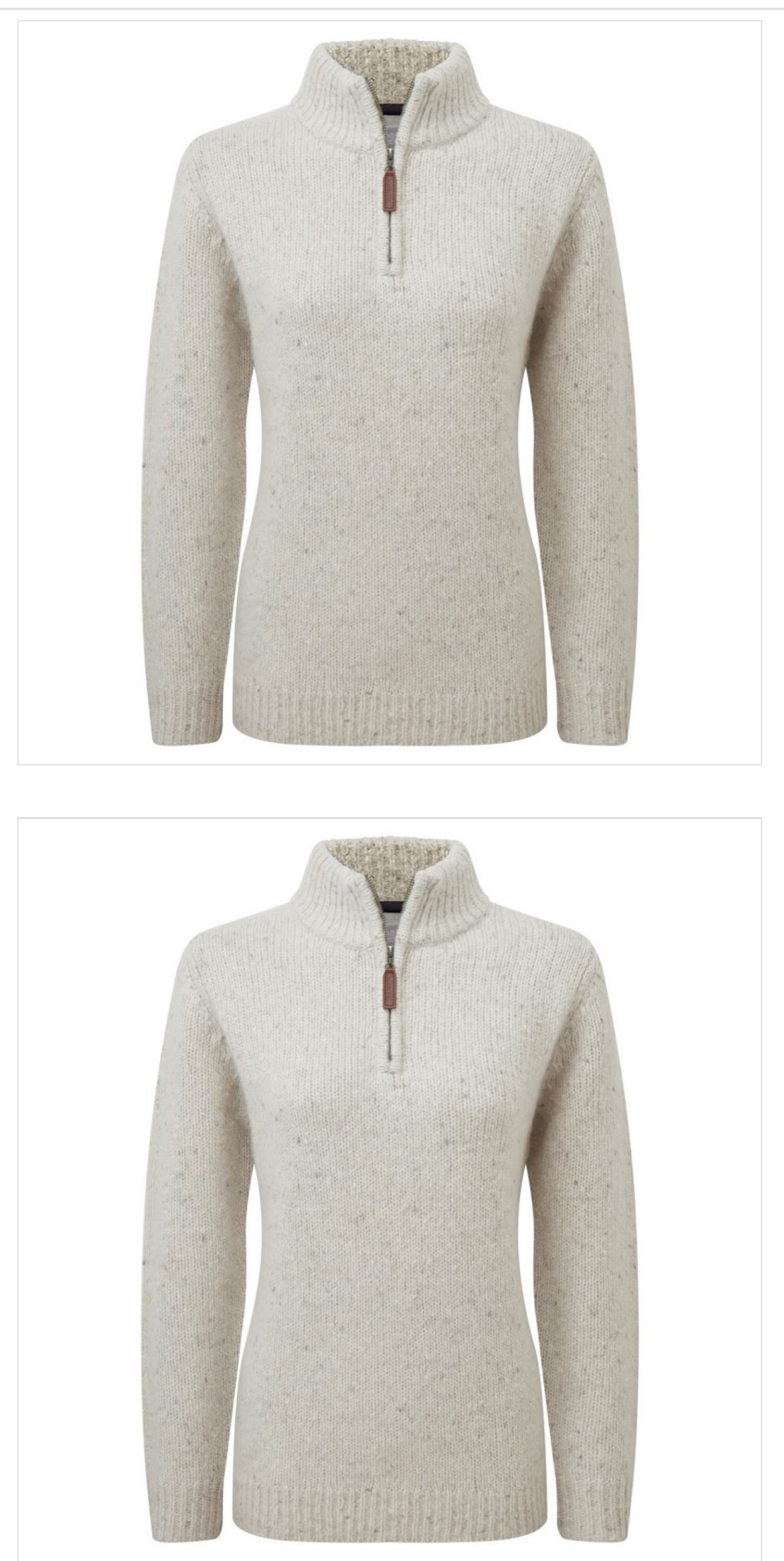
Our Price: £143.96