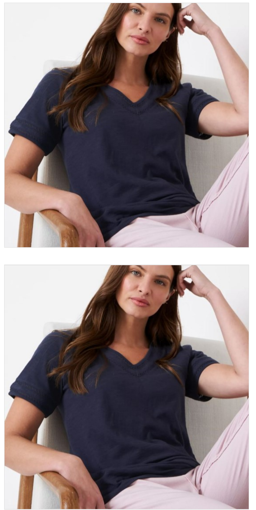
Our Price: £35