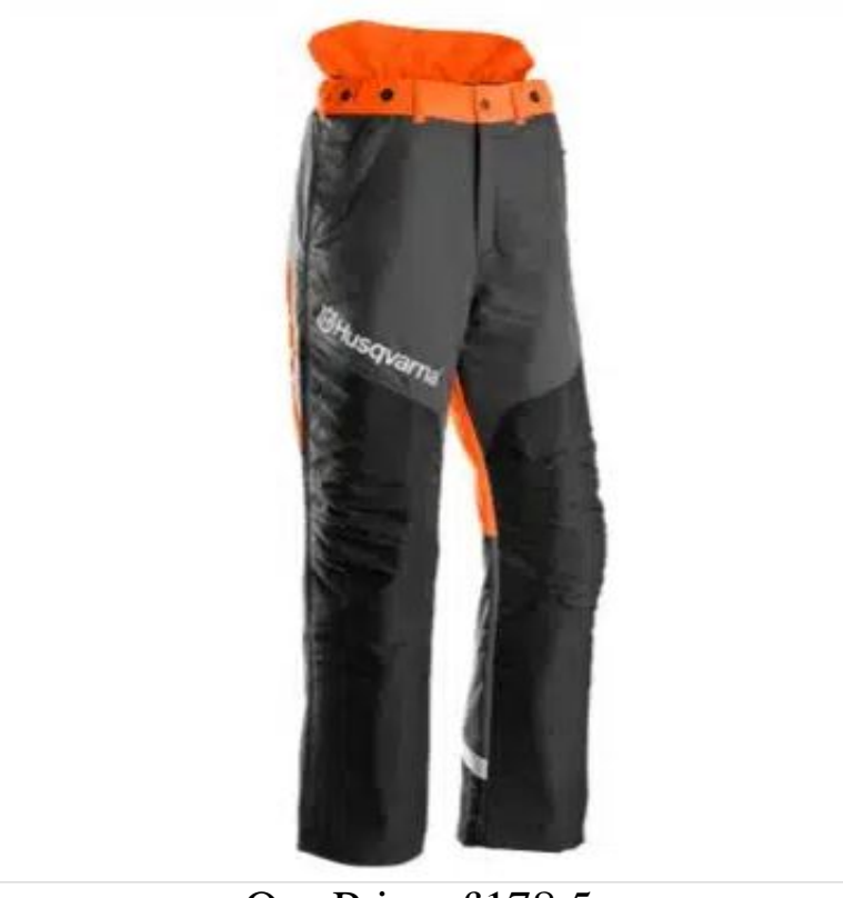
Our Price: £178.5