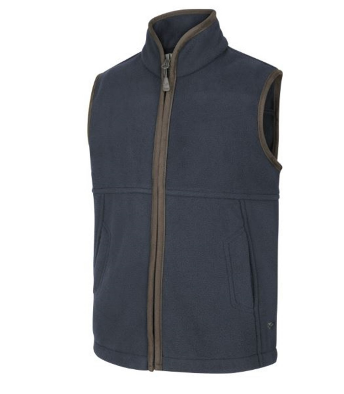
Our Price: £27.95