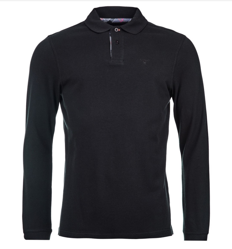
Our Price: £49.96