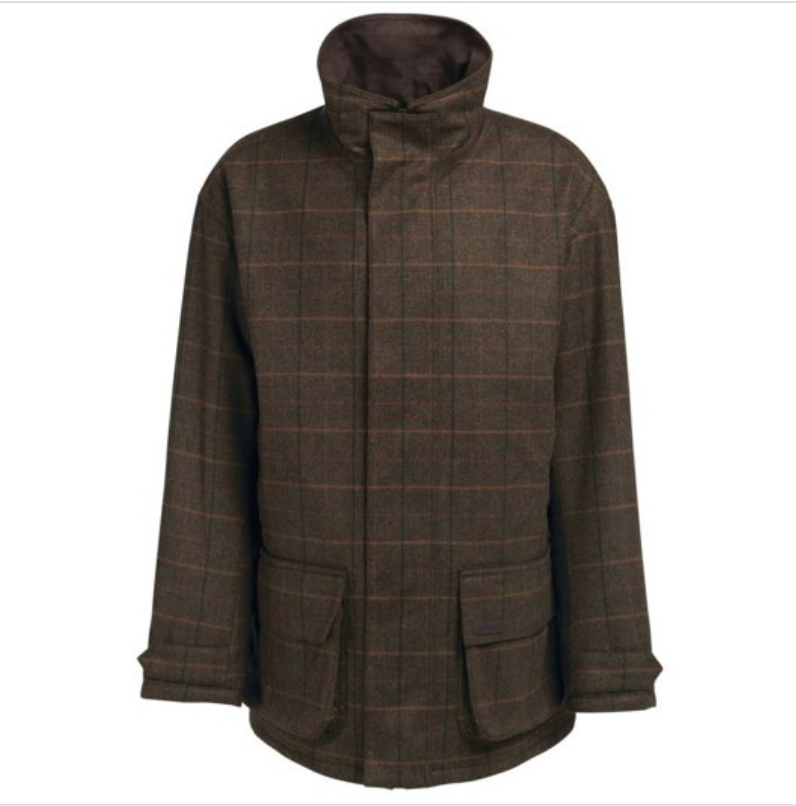
Our Price: £399