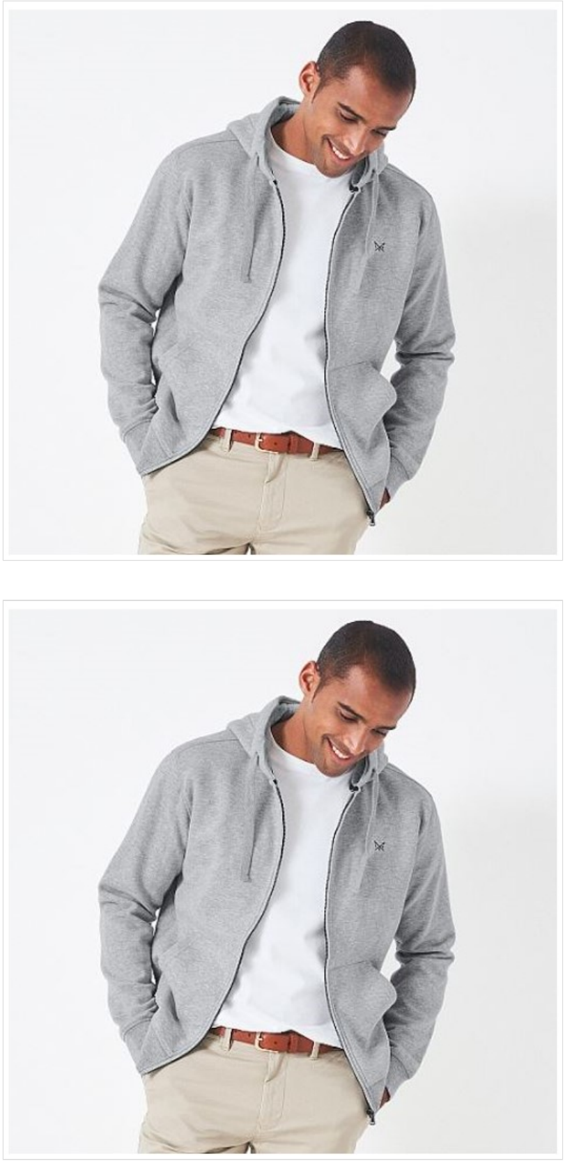
Our Price: £45