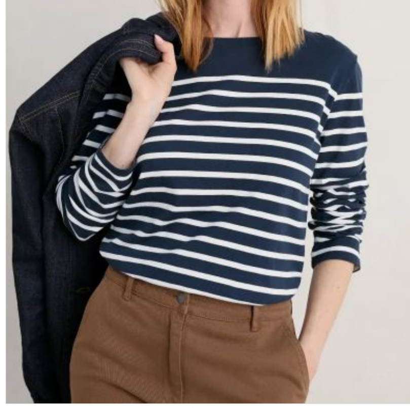
Our Price: £29.95