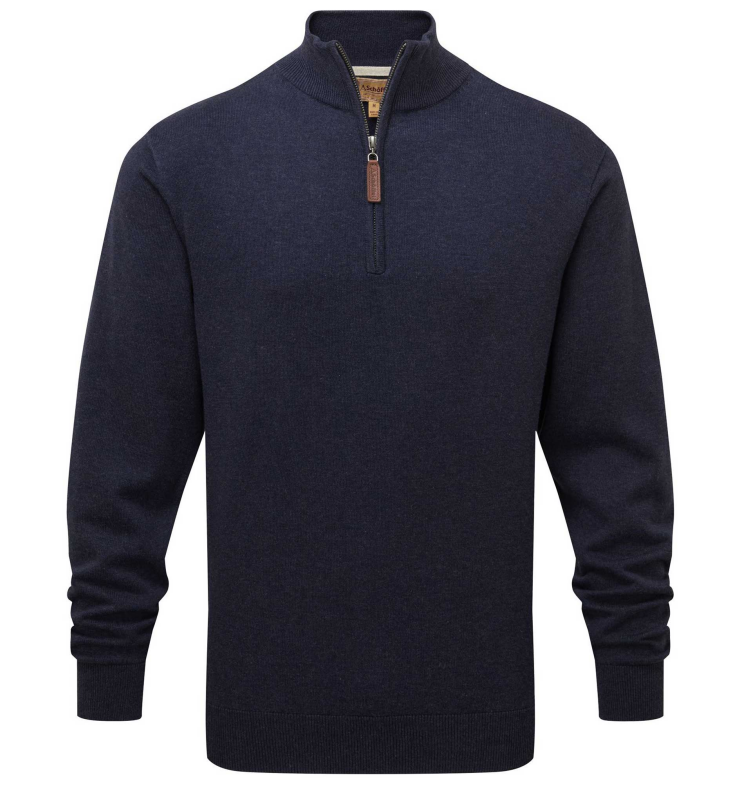
Our Price: £109.95