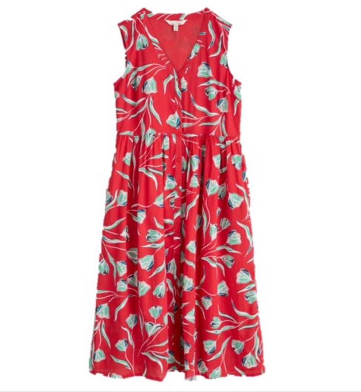
Our Price: £30