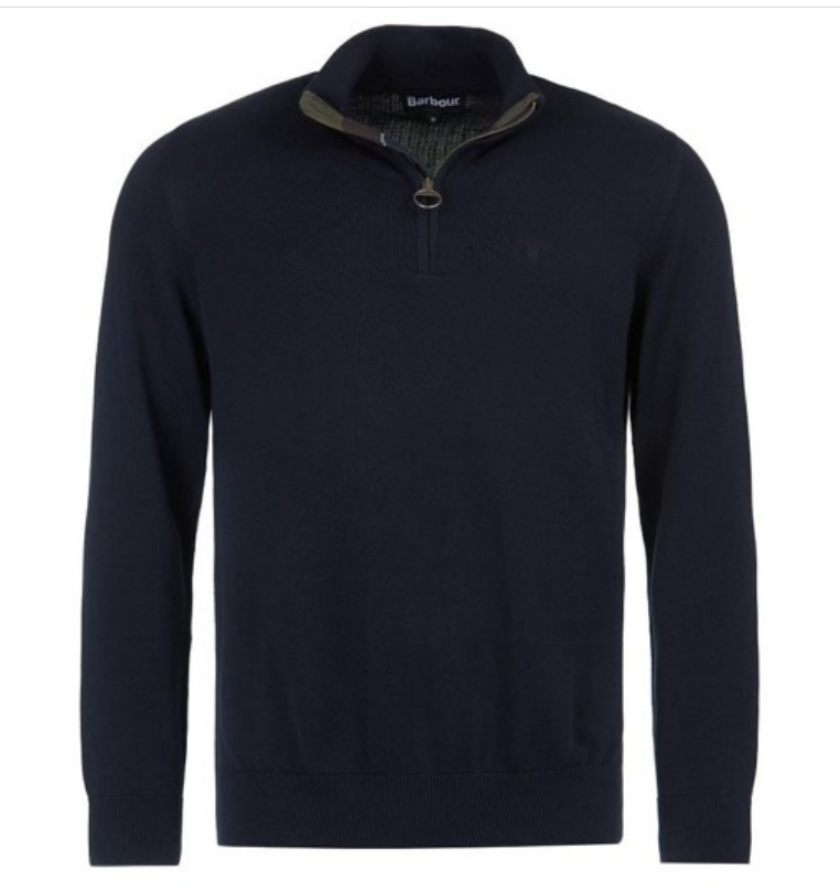
Our Price: £89.95