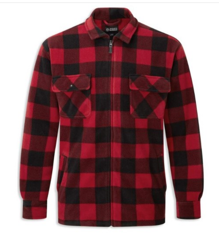
Our Price: £20.99