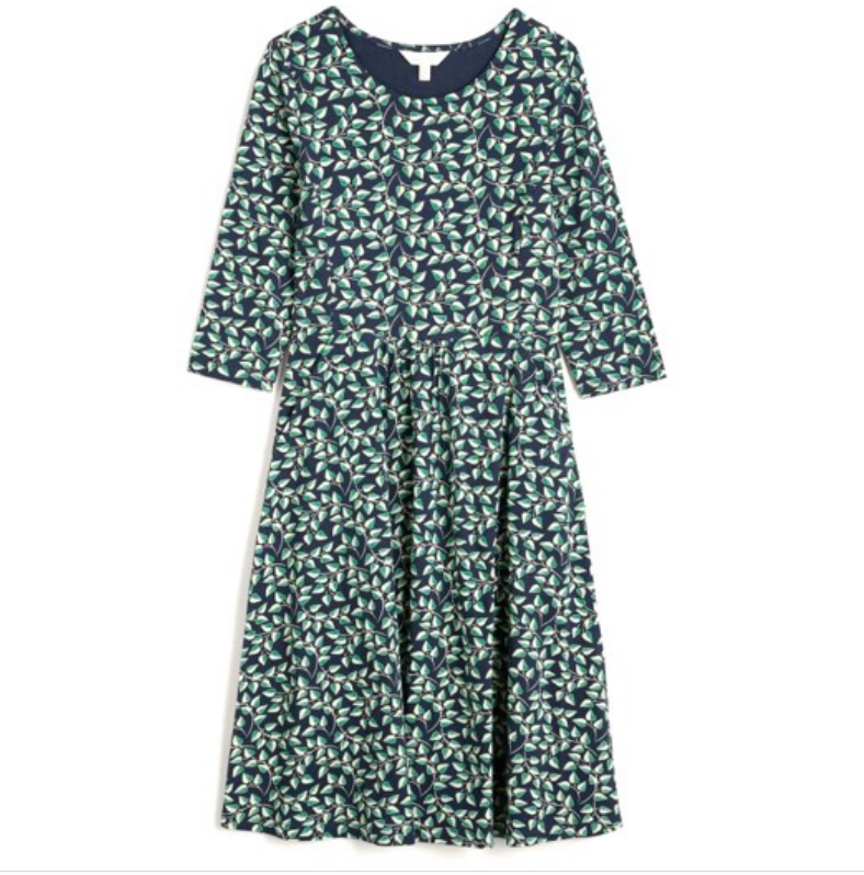
Our Price: £36